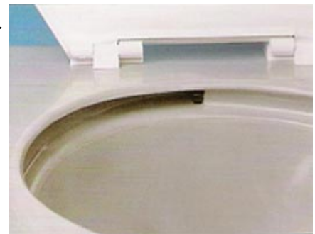
→ New Hygienic flush Vastly improved flushing is made possible by a new, open 'spiral' water channel. This replaces the traditional, vertical flange and increases both velocity and coverage of the flushing action.