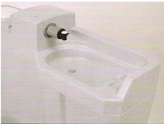
↑ Self draining hand basin is complemented by a separate soap holder and tamper-resistant hand wash tap.