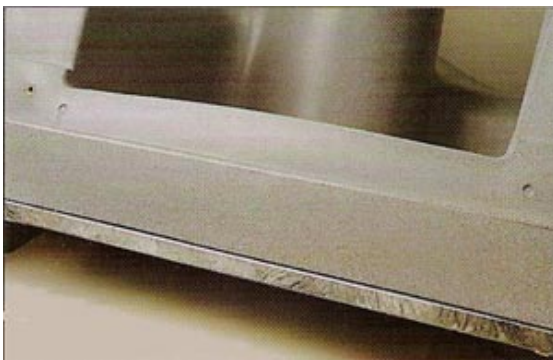
↑ The convex profile of the non-slip floor has been designed to self drain. Water is carried away either side of the door, avoiding usual entry puddle while reducing cleaning and maintenance demands.