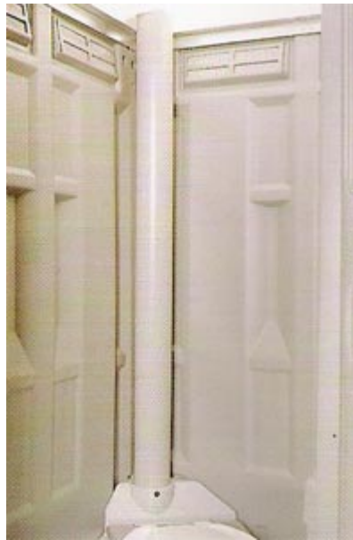
← A full size, 100mm, diameter ventilation pipe rising from the highest internal point of the waste tank, ensures thorough and adequate venting for an odour-free environment. Ventilation is a huge .353 sq. m.