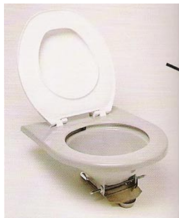
← The ultimate, one piece bowl and seat surround fabricated from rugged automotive grade polyurethane, ensures the highest standard durability and performance.